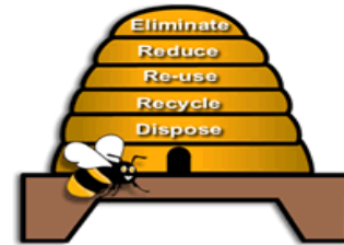
Figure 1: The waste reduction hierarchy as outlined by the Environment Agency

In 2004/5 work on the gas mains replacement programme sent 281,151 tonnes of road spoil to landfill. This was 58% of the total spoil excavated. Recognising the challenge we faced, key performance indicators were built in to the four Gas Alliance contracts, which started in April 2005. Term contractors were also encouraged to recycle and use recycled material. A five year strategy was outlined as below, and all ten contracting partners are now taking steps to ensure that waste was diverted to landfill and more recycled material was used.